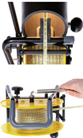
Item WLM Electronic Panel Thumb screws Set (2)